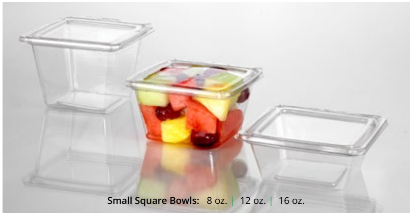
Small Square Bowls: 8 oz. | 12 oz. | 16 oz.

A contemporary look that gives your food stand-out shelf appeal. Multiple size options provide menu flexibility.