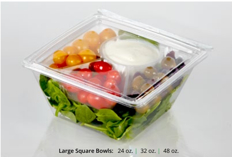
Large Square Bowls: 24 oz. | 32 oz. | 48 oz.