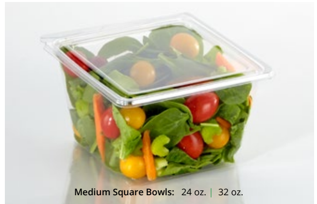
Medium Square Bowls: 24 oz. | 32 oz.